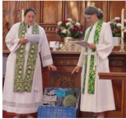
Blessed for the Pineridge Reservation. It is cold in S. Dakota