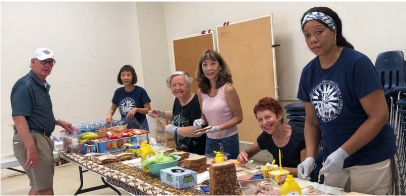
Hie Hie Lunch Crew November (nice shirts!)